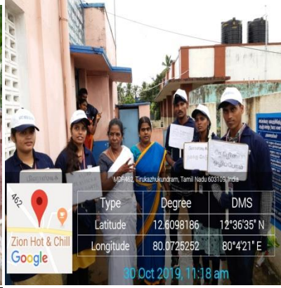
MDR462, Tirukazhukundram, Tamil Nadu 603109, India Type Degree DMS Latitude 12.6098186 12°36'35" N Longitude 80.0725252 80°4'21" E Zion Hot & Chill Google 30 Oct 2019, 11:18 am