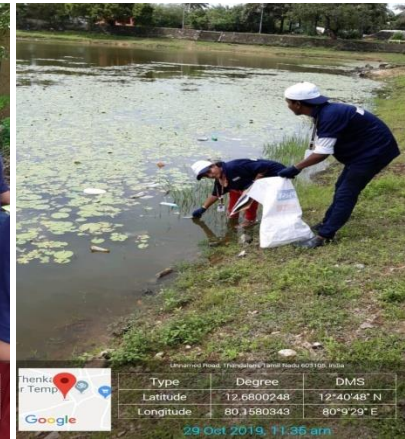
Uppanadi Road, Thiruvallur, Tamil Nadu 603104, India Type Degree DMS Latitude 12.6800248 12°40'48" N Longitude 80.3580343 80°9'29" E 29 Oct 2019, 11:36 am