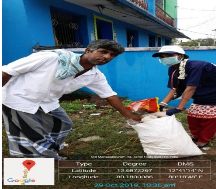
Old Mahabalipuram Rd, Tamil Nadu 603110, India Type Degree DMS Latitude 12.6872267 12°41'14" N Longitude 80.1890086 80°10'48" E 29 Oct 2019, 10:36 am