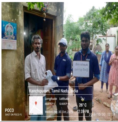
Kanchipuram, Tamil Nadu, India Longitude Latitude 80.0729° E 12.6057° N 26° C Wednesday, 30, Oct, 2019 12:39 PM