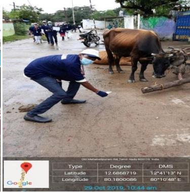
Old Mahabalipuram Rd, Tamil Nadu 603110, India Type Degree DMS Latitude 12.6889719 12°41'13" N Longitude 80.1890086 80°10'48" E 29 Oct 2019, 10:44 am