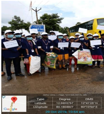
Mattur Colony, J J Nagar, Tamil Nadu 603106, India Type Degree DMS Latitude 12.6963767 12°41'25" N Longitude 80.1804827 80°10'50" E 29 Oct 2019, 10:54 am